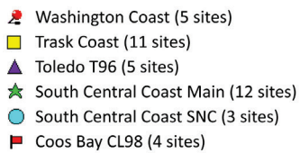
Figure 2—Second-cycle Douglas-fir test sites established on the Oregon and Washington coasts.